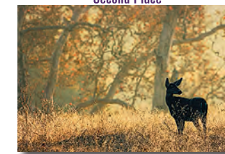
Sycamore Wild by Lawrence Piggins