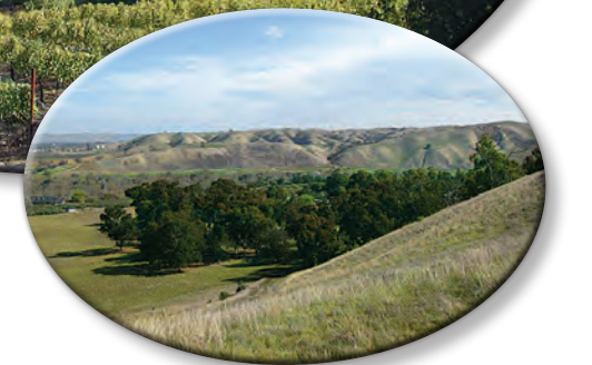
Views of the valley and rangeland as seen from the property that will become part of LARPD’s park and trail network in Livermore.