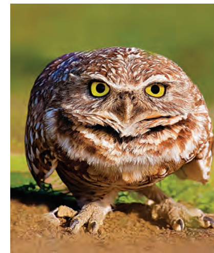
Homeless Burrowing Owl