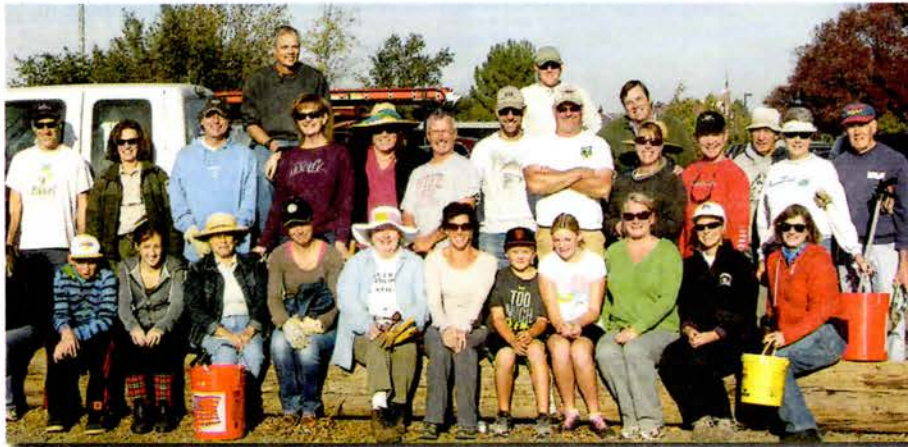
28 volunteers of all ages gathered together to help Tri-Valley Conservancy clean-up 2 miles of the Arroyo Mocho Creek. Volunteers pulled weeds, trimmed blackberry bushes, planted trees and cleaned-up trash.